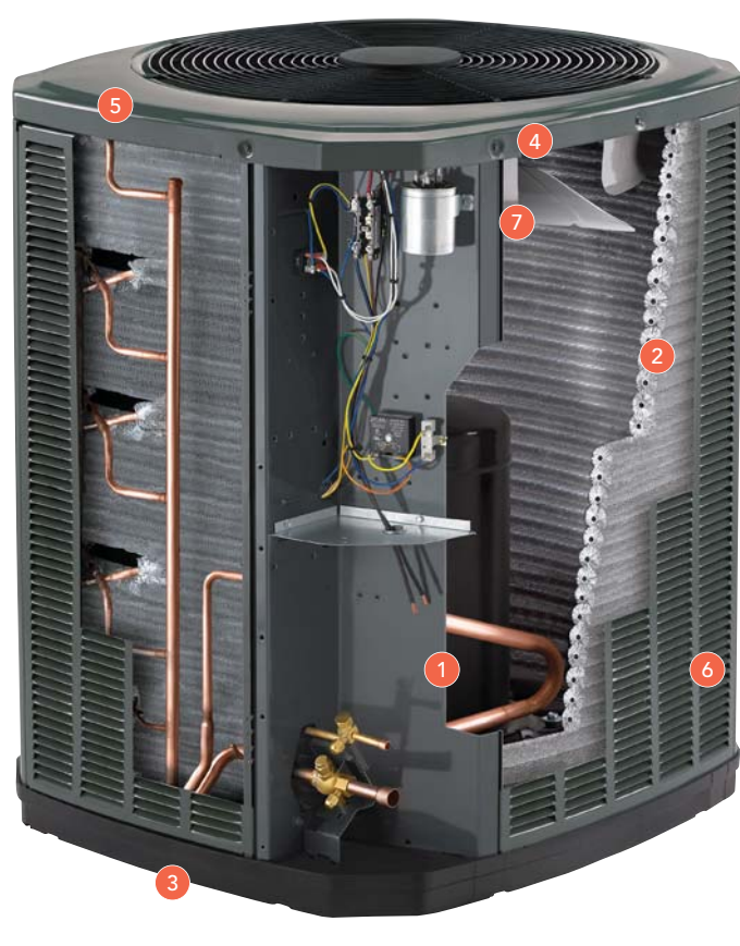
*XR17 shown for illustration purposes